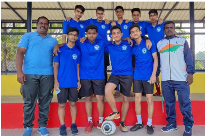
Under-16 Football Team [Boys]