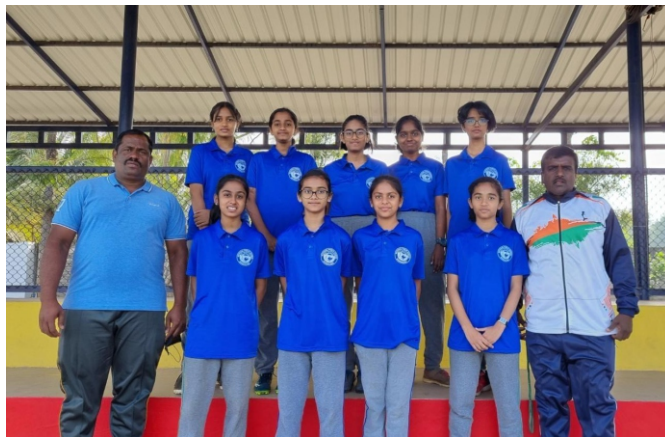
Under-14 Football Team [Girls]