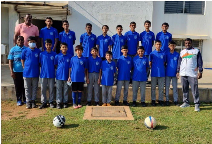
Inter-School competition [Under - 12 & 14 Football & Basketball - Boys] Greenfield Public School

Throughout the course of this academic year, the students of NPS, Yelahanka participated in several inter-house and inter-school competitions with regards to various categories in the field of sports.