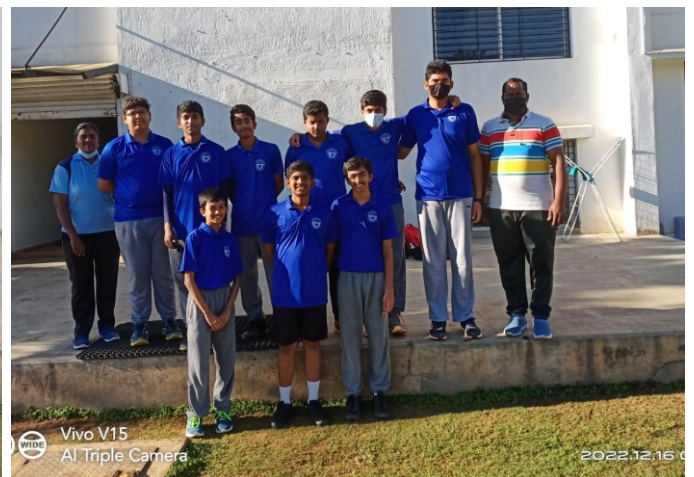
Inter-School competition [Under-16 Volleyball Team - Boys] Vidyashilp Academy