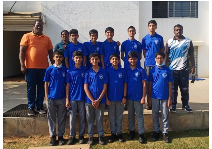
Inter-School competition [Under-14 Basketball Team - Boys] Newage World School