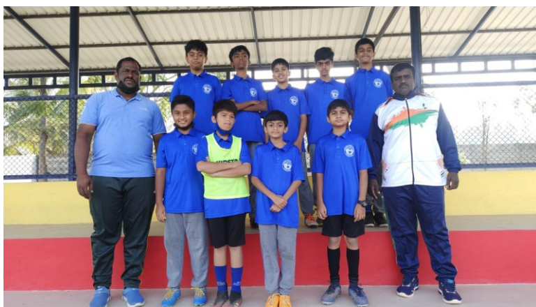
Under-12 Football Team [Boys]