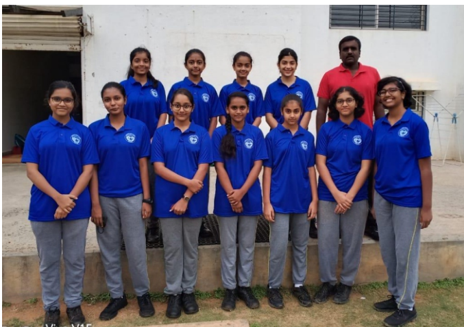
Inter-School competition [Under-16 Throwball Team - Girls] Vidyashilp Academy